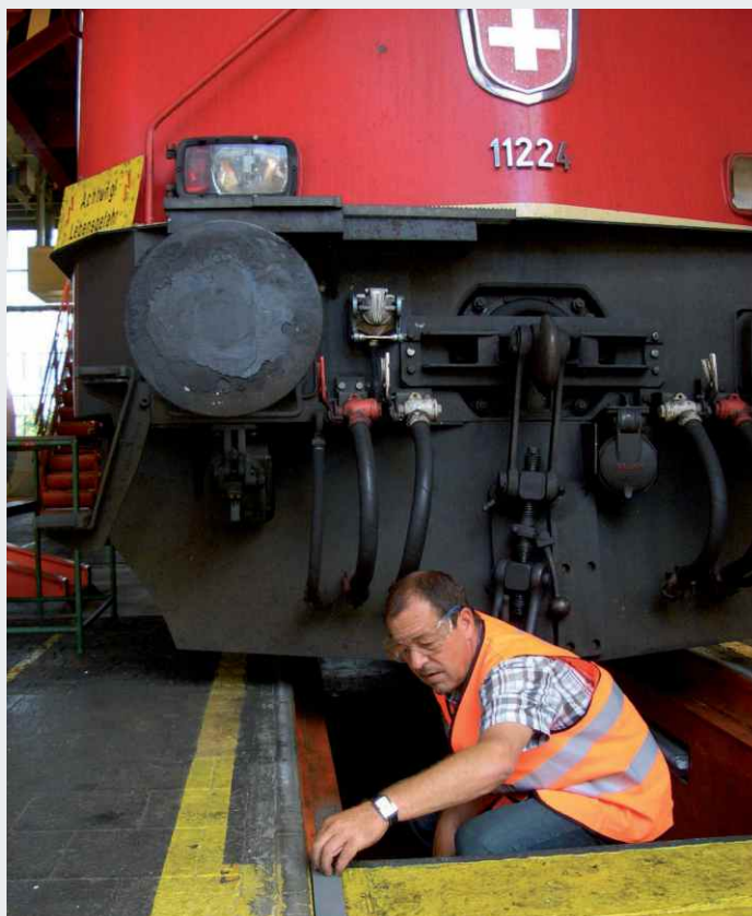
Rail groove fillers at the SBB workshop

Whenever street users and railway tracks meet, safety is the top priority. The groove between the rail and the guard rail or between the rail and the trackslab surface for level crossings and track systems represent a danger for pedestrians and single-tracked vehicles.