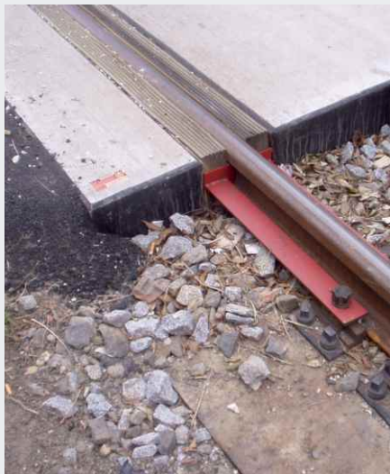
Installation in slab track

Sylomer® rail groove fillers are made of a closed-cell polyurethane elastomer. The product is characterized by excellent stability and wear resistance. With polyurethane materials, contraction or expansion of approximately 1 - 2 cm is possible due to material and weather conditions. This, however, has no effect on the functionality of the groove filler-profile.