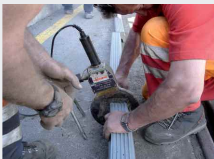
Welding the groove filler profiles together

If the Sylomer® groove filler profiles are to be bonded together using adhesives, the instructions of the adhesive producer, such as mixing ratios, setting times, curing times, ambient temperature for use etc. must be complied with.