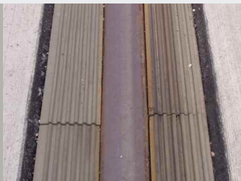
External groove and rail groove filler