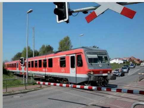
Level crossing with Sylomer® rail groove fillers