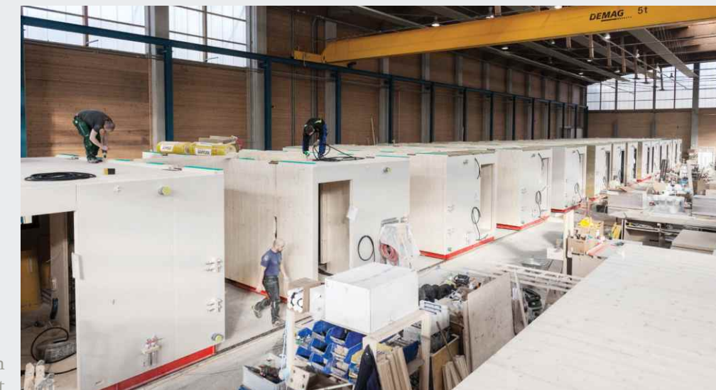
Manufacturing of the modules with Sylodyn® linear support