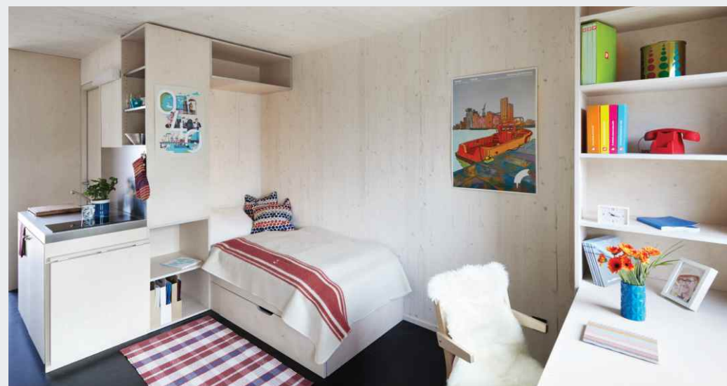
Pre-fabricated and fully furnished modular apartment

The quality of the vibration isolation material is certified by the German Institute for Building Technology with a national technical approval (abZ). This approval also guarantees the reliability and durability of the material in conformity with the latest technology standards. Sylodyn® and Sylomer® from Getzner are the only polyurethane materials in this field to have been awarded this approval, making it an obvious choice for construction projects.