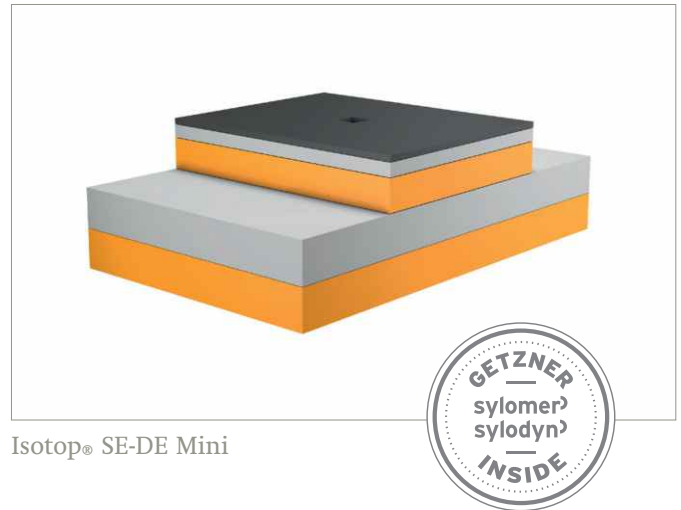
Isotop® SE-DE Mini

All SE-DE Mini elements can be screwed to the device to be insulated using screws with an M12 thread. The upper pressure plate is equipped with an anti-slip plate to prevent the device positioned on top of it from slipping inadvertently. Installation without attachment is possible on request. The device frame must be level and a full-surface contact between the element and the device and floor must be ensured. The element should always be loaded in the centre. For more details see the Getzner installation instructions.