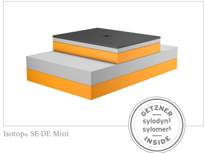
Isotop® SE-DE Mini

All SE-DE Mini elements can be screwed to the device to be insulated using screws with an M12 thread. The upper pressure plate is equipped with an anti-slip plate to prevent the device positioned on top of it from slipping inadvertently. Installation without attachment is possible on request. The device frame must be level and a full-surface contact between the element and the device and floor must be ensured. The element should always be loaded in the centre. For more details see the Getzner installation instructions.