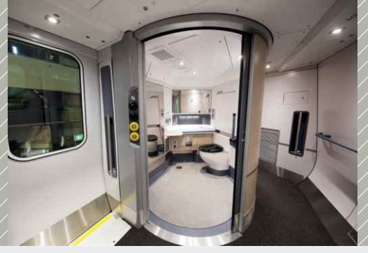
Getzner is equipping all trains manufactured for the programme between 2014 and 2018 with bearings for floating floors