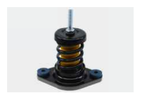
9. Fix threaded rod

Fix locking ring in place using the threaded nut.