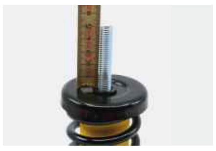
8. Fit threaded rod

Fix bolt from below and screw on Isotop spring.