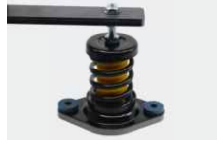
11. Fix device or device frame

Screw the threaded nut onto the threaded rod, add the locking ring and adjust the height of the device or device frame.