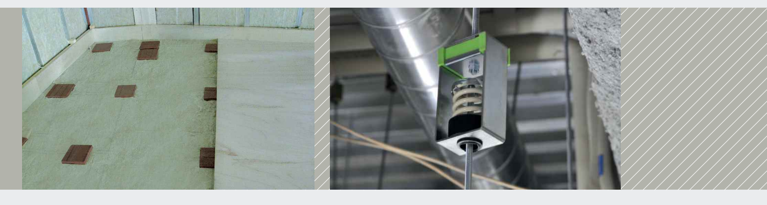
Sylomer® point bearing for vibration isolation of floors