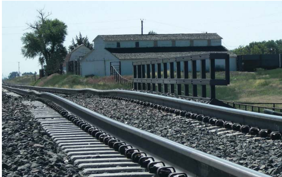
Transition zones with varying track stiffness need extra maintenance and absorb disproportionate maintenance effort.

The proportion of transition zones is vanishingly small, implying that the somewhat higher investment costs, because of using the best possible elastic superstructure components and a technically optimized solution, are recovered very quickly.