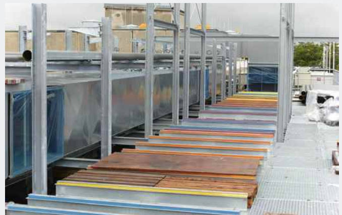
Strip bearing prepared for a rooftop ventilation unit