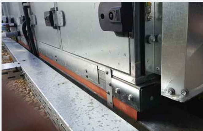
Strip bearing for ventilation and air-conditioning unit (HVAC)