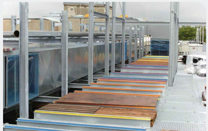
Strip bearing positioned in readiness for a rooftop ventilation unit