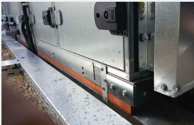
Strip bearing for air conditioning (AC) unit