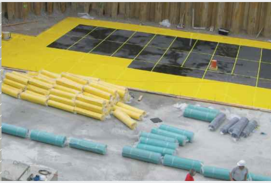
Professional building protection using Sylomer® and Sylodyn®