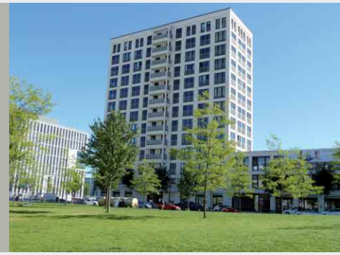
Panorama Tower – economic and efficient vibration and sound insulation